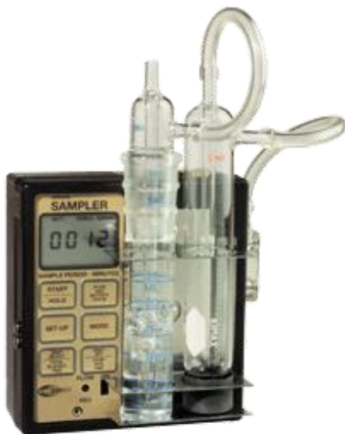
Glass impinger sampler