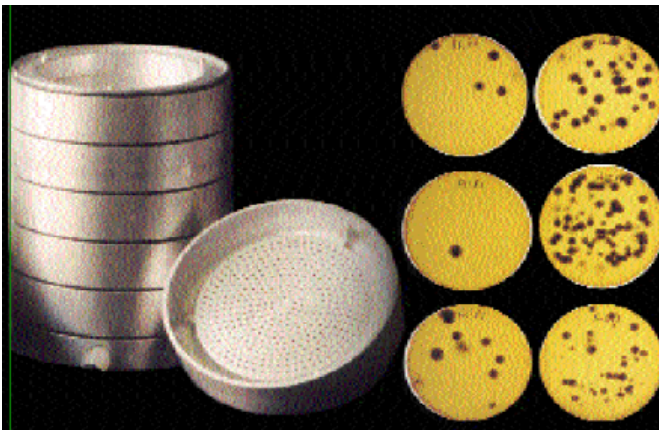
Sieve impactor sampler